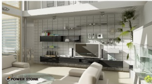
Suspended in any combination