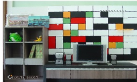
Colors can be arranged freely