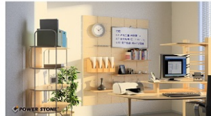
Flexible space application